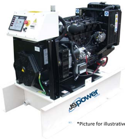
*Picture for illustrative purposes only